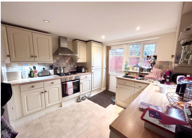
Address: 5 Nursery Gardens, West Street, RYDE, PO33 2DF RRN: 7034-4429-3300-0632-3206

While every attempt has been made to ensure the accuracy of the floorplan contained here, measurements of doors, windows, rooms and any other items are approximate and no responsibility is taken for any error, omission or mis-statement. This plan is for illustrative purposes only and should be used as such by any prospective purchaser. The services, systems and appliances shown have not been tested and no guarantee as to their operability or efficiency can be given. Made with Hectopix 12/2023